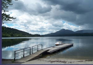
Lake Cocolalla Public Boat Launch